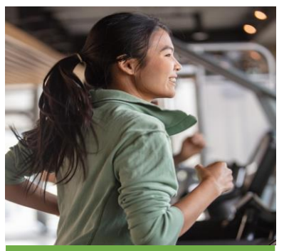
373 Registered Participants