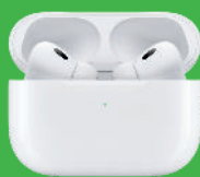
APPLE AIRPODS PRO