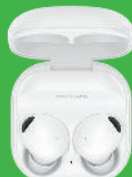
SAMSUNG BUDS PRO